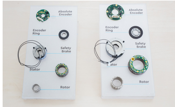
TQ-RoboDrive's frameless servo kit solutions on display.

Improvements in existing AksIM technology were implemented to meet the challenging requirements of the electric motor such as extended temperature range, higher immunity against stray magnetic fields and ease of set-up.