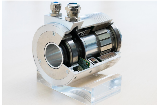
Cut-away of a TQ-RoboDrive hollow-shaft servomotor with an AksIM™ magnetic absolute encoder.

“The world of collaborative robotics in particular is still relatively small, but it is growing dynamically with every year. Within this community, I see the need for constant dialogue amongst suppliers and customers to ensure that we’re all working to fuel the newest trends and solve the biggest challenges. It is very important to have a reliable encoder partner. The variety on the market is huge and we needed the best technology that would fit into our motors. One of the benefits of a partnership with RLS and Renishaw is that they are key players on the market with products that everybody knows. Trouble shooting is also much easier as TQ-RoboDrive can call on RLS and Renishaw for technical support if needed.”